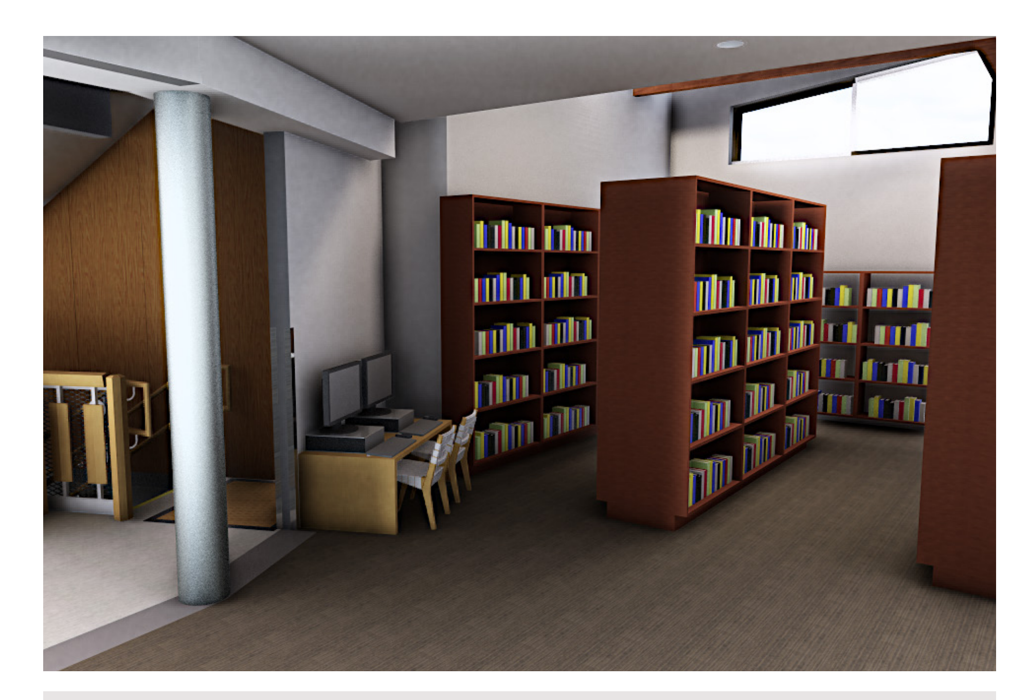
PROPOSED CHILDREN'S COMPUTERS

Currently, computers are located on the main and mezzanine areas of the library. A bank of eight computers will be located in the areas behind the elevator, increasing the total number of computers. Children's computers will be located nearby in an area in front of the elevator.