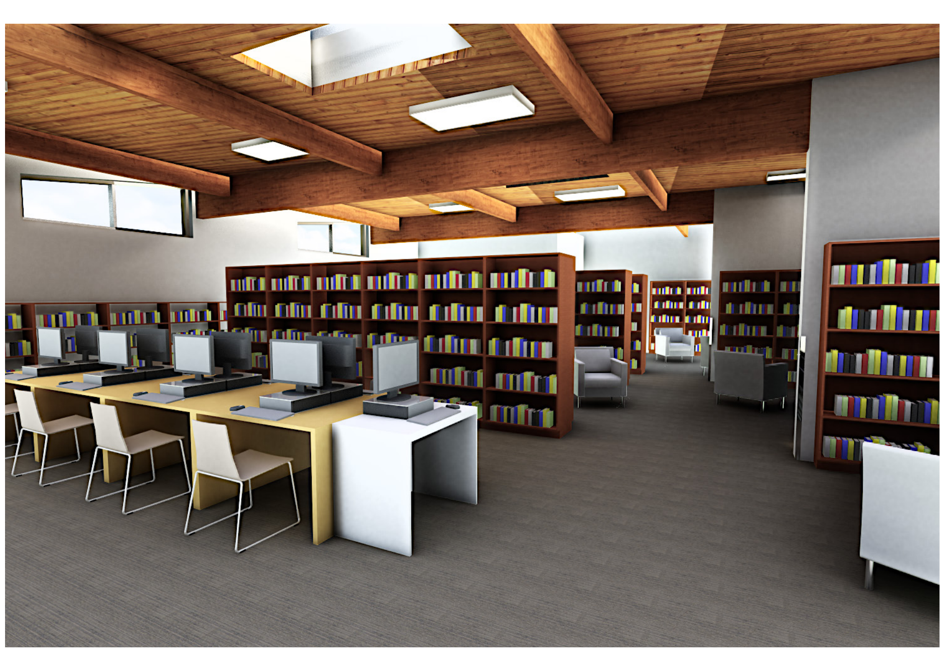
PROPOSED ADULT COMPUTERS