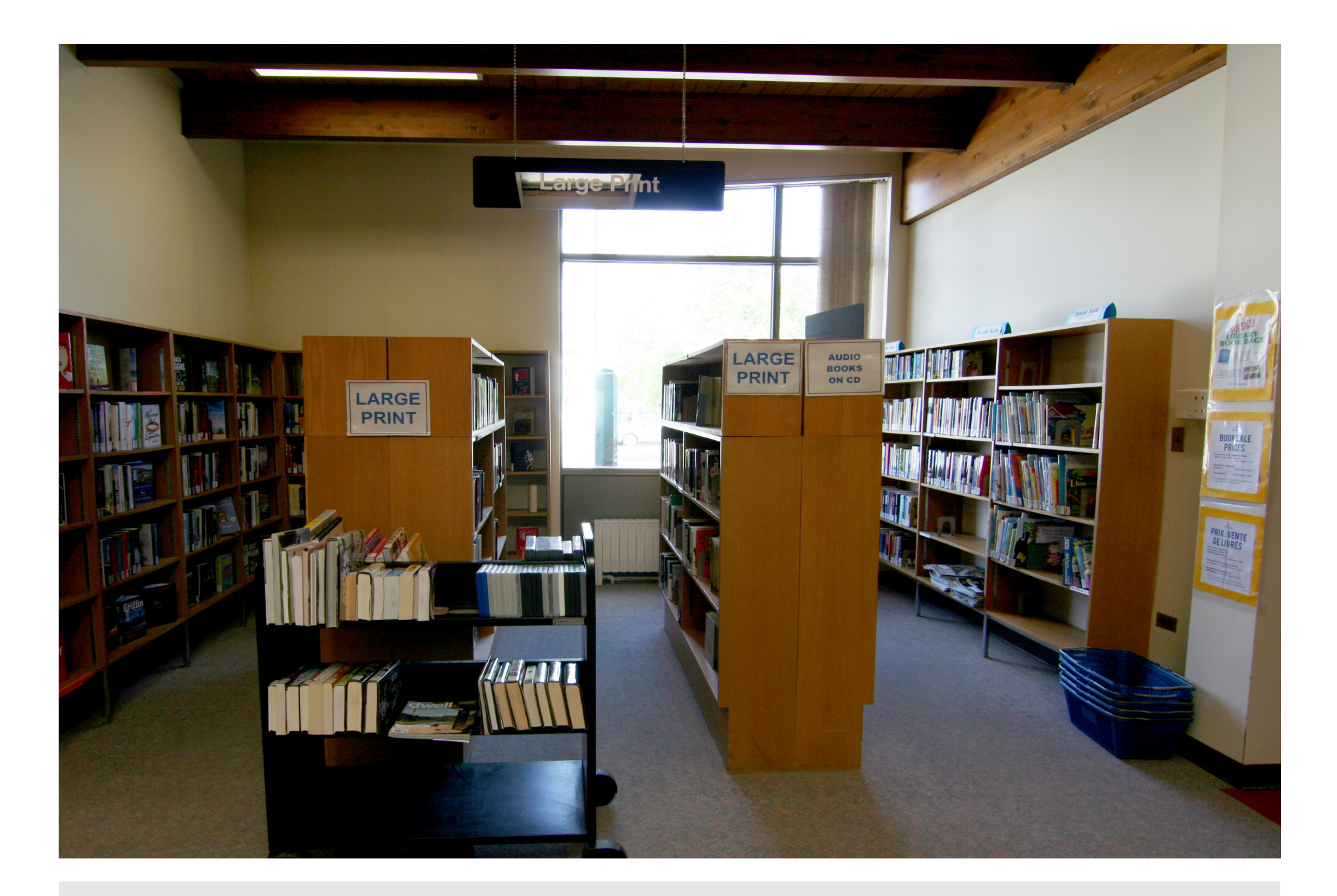
EXISTING NOOK WITH BOOK STACKS (ALONG NORTH WALL)