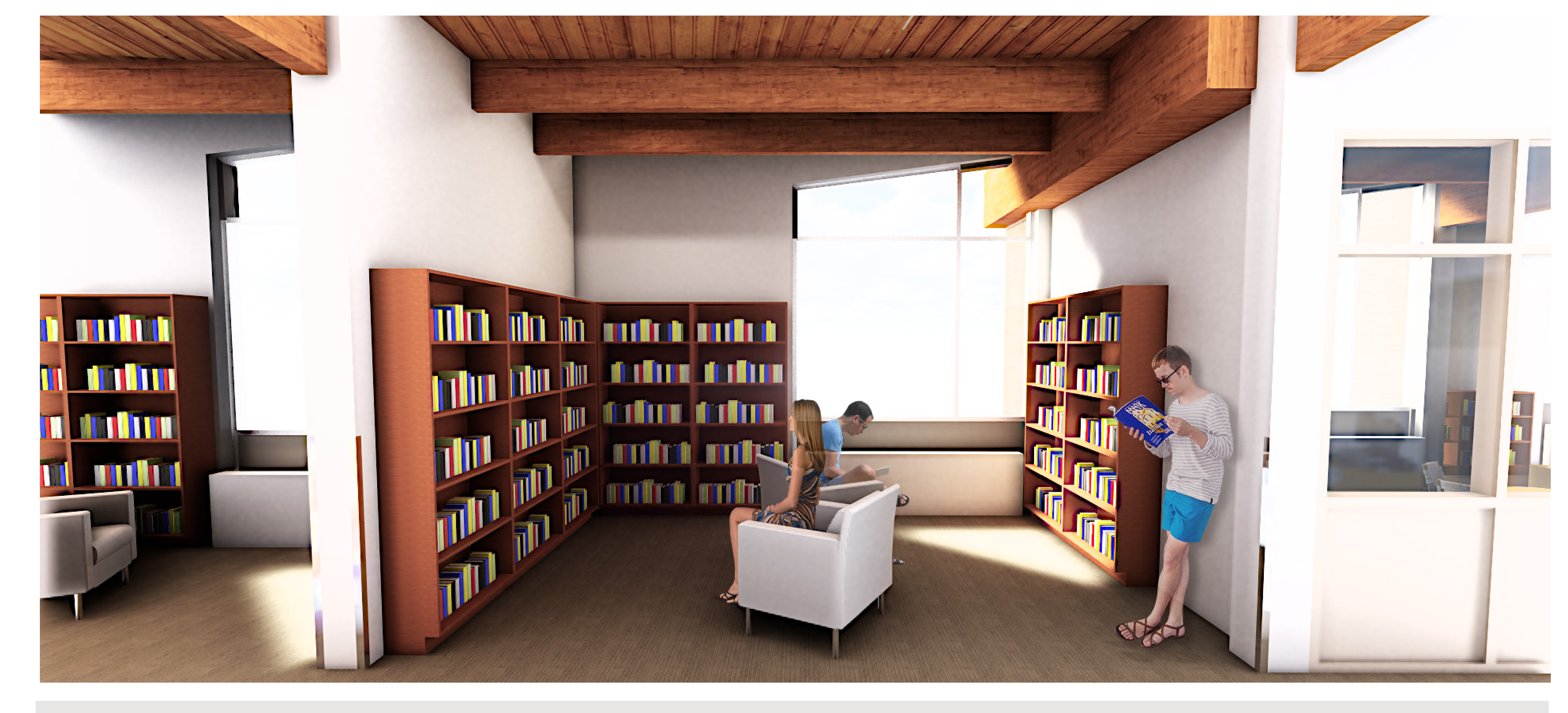
PROPOSED READING NOOK (ALONG NORTH WALL)

Three reading nooks will be created along the north elevation of the building, each with windows to allow for natural light.